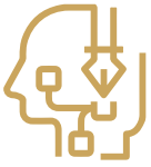
People or organisation

Gain the understanding of what is holding you back on making innovation a success and building a culture of innovation. During this workshop we will examine your three pillars of innovation: